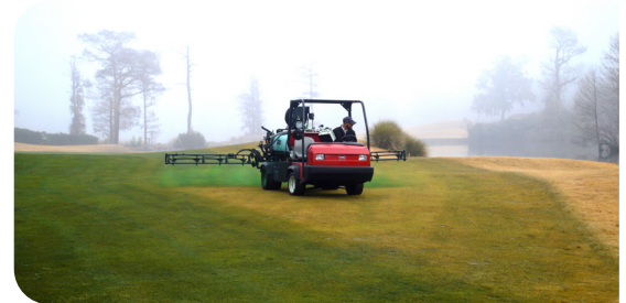
Spraying Dormant Green - January 1, 2017